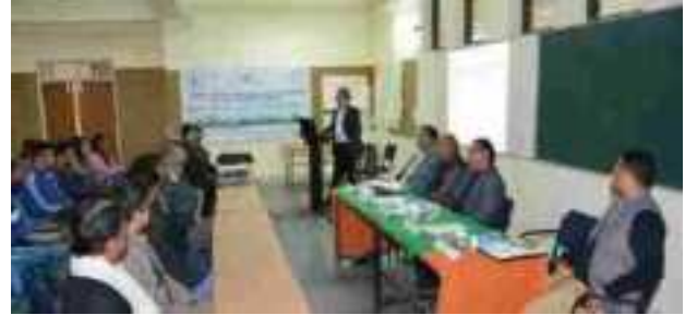
Participated in Laurie Baker Center Workshop.

Established Student Chapter of Indian Green Building Council (IGBC).